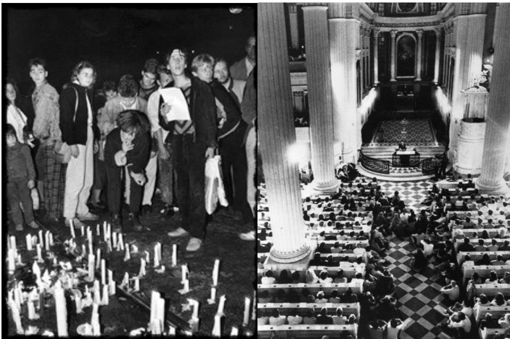
Leipzig, Germany 1989